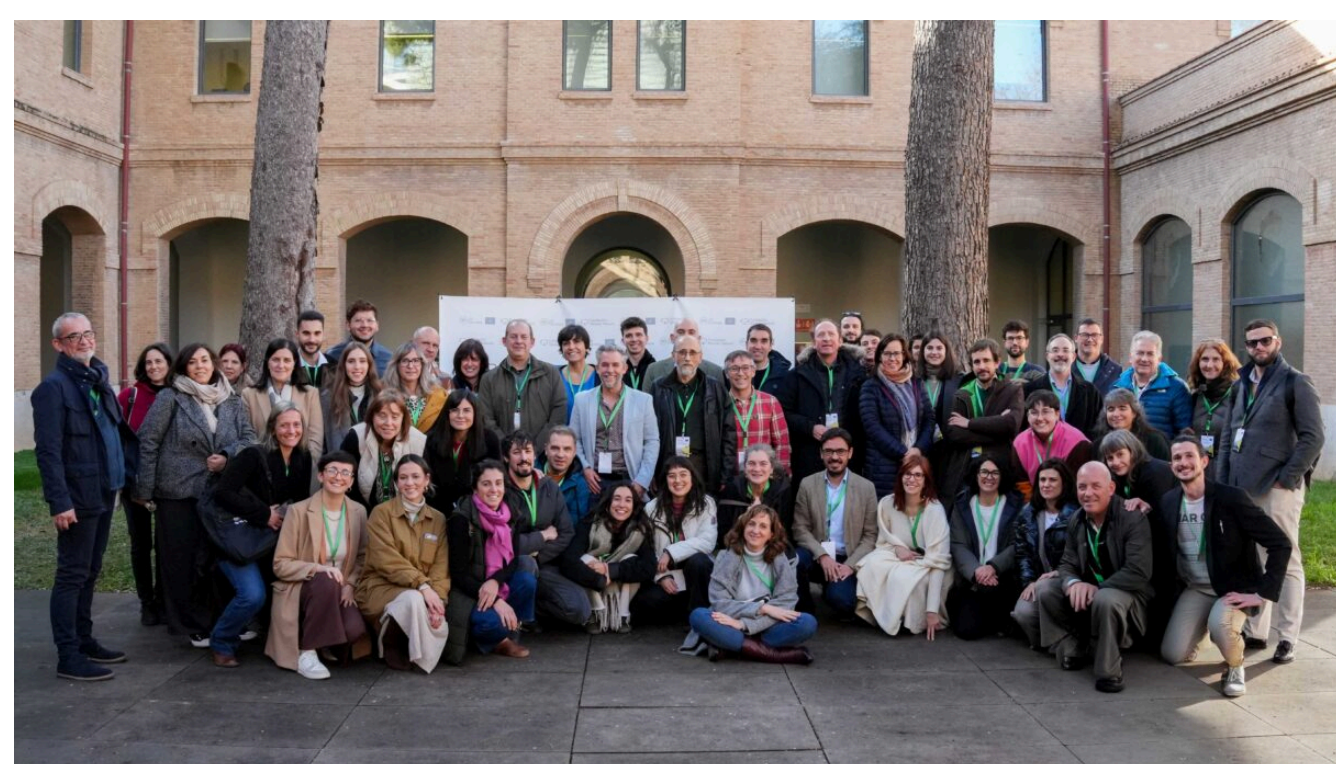
A cycle of workshops on innovative financing for conservation begins to connect companies and land stewardship entities