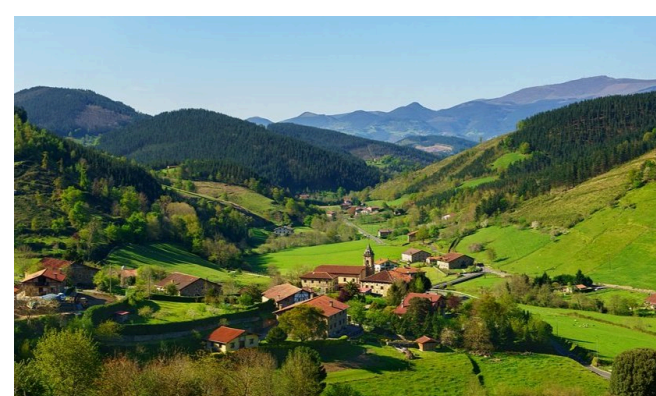
Workshop on regulatory and administrative aspects of land stewardship for local authorities