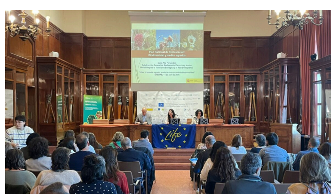
Third workshop on agrarian stewardship and biodiversity conservation