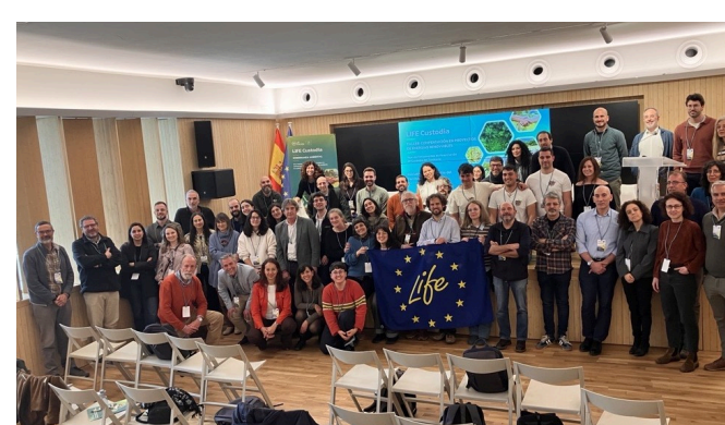
Second workshop on offset measures

The series of workshops on innovative financing for conservation continues, connecting companies and land stewardship entities